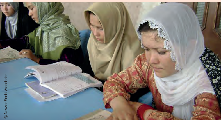
>> Our Afghan partner organization Neswan offers literacy courses for women in the Shahrak women's center

In our work we focus on public relations, fundraising and the acquisition of public grants to support our courageous colleagues abroad. The cooperation with our partner organizations is at eyelevel. Transparency, regular reports and yearly visits are important for us, thus securing the sustainability and impact of our cooperation projects. Due to growing anti-feminist movements worldwide, we plan to support threatened women's rights activists and feminist initiatives as of 2021, in addition.