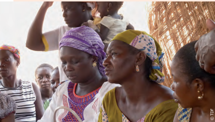
» Awareness campaign to end FGM in Burkina Faso

Up to 15 girls and women per month find help at the women's shelter CAECF, which was opened in 2015.