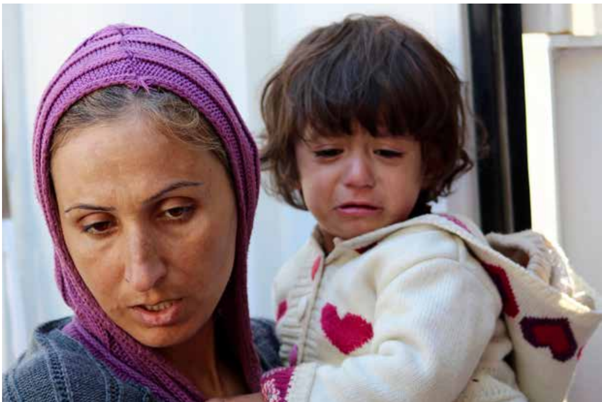
A mother and baby queue for aid in Presevo refugee center, Serbia.

The protection risks that women and girls face in all humanitarian crises are exacerbated in Europe by the lack of meaningful options to seek asylum along the route, mechanisms to facilitate family reunification, and case management and social support to integrate even if they are able to find safety. Most are trying to reach countries where they hope to find a structure to support asylum seekers that will make fair deci-